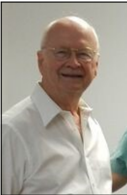
PASSING THE TORCH....(pun intended)

March 20, 2021 4th Annual CMGS Rock Swap Wickham Park Pavilion 4