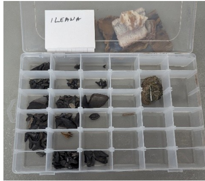
Ileana Tibuleac- Fossils