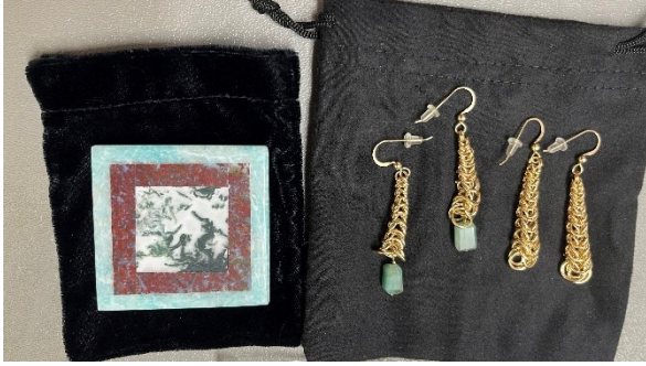
Yvonne – intarget and chain mail