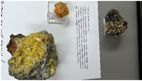
Mineral of the Month – Wulfenite