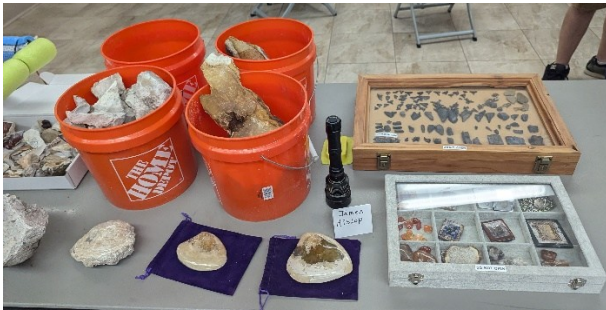
James talked about peace river fossils Had material from Curt