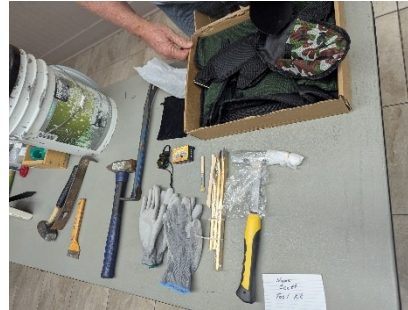
Scott – Tool Kit