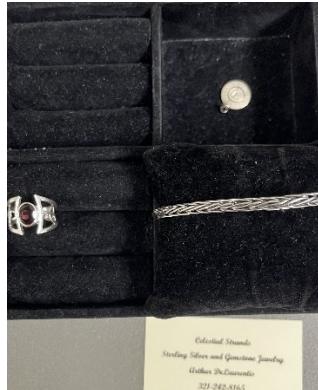
Arther Delaurmetis Amethyst ring and bracelet using loop technique