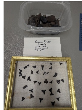
Sharron Barhost – fossils