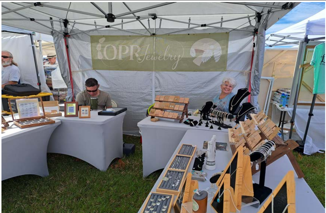
Out And About with OPR Jew- elry